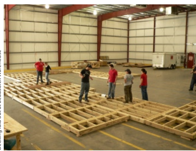
Decking laid out at BeauSoleil Warehouse