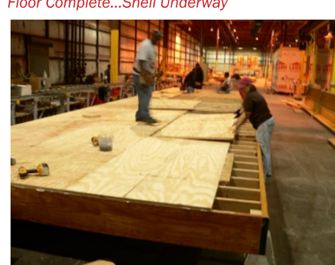
Members of TEAM BeauSoleil Construct floor at LASBH

TEAM BeauSoleil has been traveling back and forth to Louisiana System Built Homes of St. Martinville to continue construction of the BeauSoleil Solar Home . The floor is complete and the shell of the home, constructed of SIPs (Structurally Insulated Panels) will be delivered to the warehouse in the upcoming weeks. Our commemoration event on March 4, 2009 will celebrate the shell delivery and jump start construction here in Lafayette .