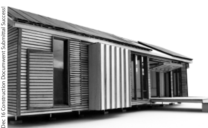
Dec 16 Construction Document Submittal Success!

The US Department of Energy requires all teams to submit deliverables in preparation for the Solar Decathlon 2009 . As part of the December 16 Deliverable , TEAM BeauSoleil submitted both Construction Documents , 134 pages of drawings and details; Project Manual , a compiled PDF of CSI MasterFormat 2004 Specifications ; and Project Narratives . We are confident that TEAM BeauSoleil is on a path to success.