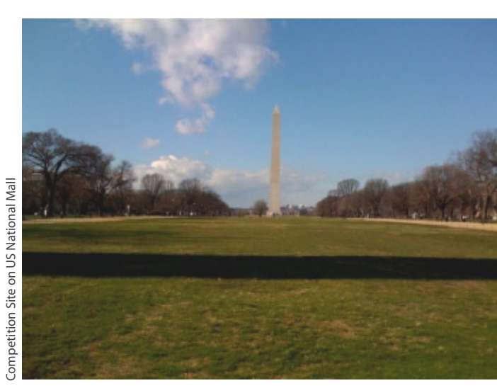
Competition Site on US National Mall